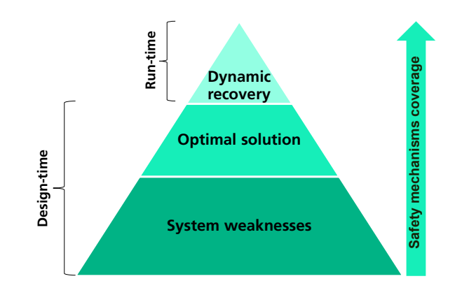
Fig. 1. Underlying structure for the dependable system architecture development (simplified form)