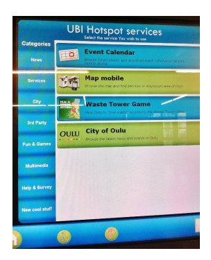
Figure 3. UBI Platform Interface.

As the interaction with the UBI platform is done through smart displays and not with mobile devices, and taking into account that to identify the individual's roles it is necessary that participants are available online, we have designed a mobile application in Android to support all these issues.