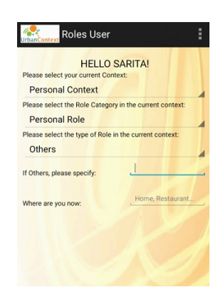
Figure 4. UrbanContext Android Application.

In Oulu, there exists demographic repositories with data coming from the users of the UBI platform. These data are combined with the data coming from the UrbanContext Application to obtain context enriched individual information.