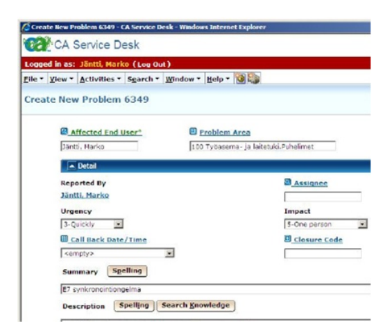
Figure 3. A problem ticket

technique. We selected four real customer support cases, analyzed the workflow, and compared the handling procedure to an ITIL-based handling procedure. The improvement work also included the configuration and customization of a problem record (see Figure 3).