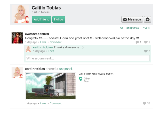
Fig. 1. User profile of an Second Life resident in the online social network My Second Life showing a posting, a shared snapshot with location information (Silver Sea), and a comment.

To predict the social interactions between users we employed location information obtained from three different sources of data.