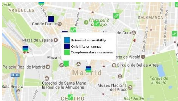
Figure 5. Adding detailed accessibility in Google Maps.

Following these specifications, we added these new attribute values to GTFS stops.txt file and trips.txt files. Figure 4 shows the stops.txt file with the values concerning the accessibility in the Sol stop place. We have omitted some fields in the central part of every row with the purpose of highlighting the additional accessibility fields added, which are also emphasized. This new accessibility information could be represented in Google Maps. In Figure 5 we mark the accessibility by means of colours in the Sol area: