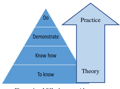
Figure 1. Miller's pyramid

As stated by Vázquez and Guillamet [2], it has been shown that the use of these clinical simulations reduces the time needed to learn the skills. Figure 1 shows Miller's pyramid, where in the DEMONSTRATE and DO levels the learning processes in simulation are found [3].