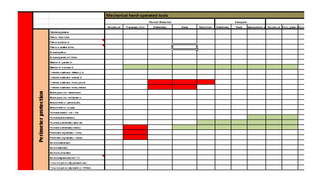
Figure 2. Proposal of delay time data matrix

In compiling and completing this matrix, several issues arise. Before we get to the most important one, which is the great amount of missing data, let us begin with the complications related to the selection of suitable representatives, both on the side of passive security elements and structural barriers, as well as on the side of tools used to breach them.