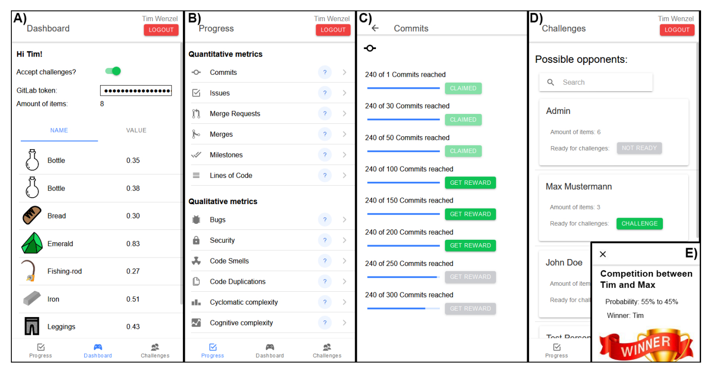
Figure 2. User Interface (UI) of the mobile web application, showing A) the Dashboard and the user's reward items, B) a Progress overview of the evaluation criteria, C) details of the quantitative criterion 'commits', D) the selection of an opponent for a challenge, and E) the outcome of such a challenge.

Future work will now focus on the ability to tune the gamification parameters to individual project needs, as well as to extend the concept of weekly challenges.