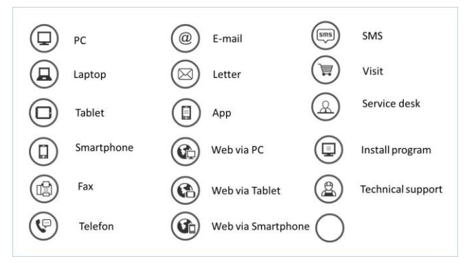
Figure 3. SJML icons given at the workshop

Participants were divided into four working groups and asked to make customer journey maps of the service process of borrowing paper and electronic books at the library using SJML. One blank icon plus seventeen book loan service relevant icons which were selected among 32 SJML icons were given to each group as a set (Figure 3). In this workshop, the actor and status concepts were not adapted.