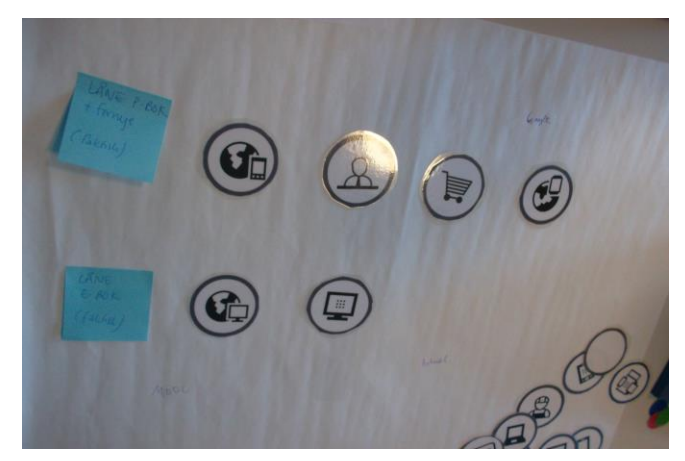
Figure 4. Customer journey maps for a customer borrowing a paper book (up)/electronic book (down) in existing book loan service at the library

First task was to present customer journey for a customer borrowing a paper/electronic book (Figure 4.). The process includes extension of the loan and finishes with when the book is returned. Second task was to present customer journey for a customer ordering a paper/electronic book which the library does not have. The process includes extension of the loan and finishes when the book is returned. Participants were asked to make customer journey maps for the both existing (Figure 4.) and desired book loan service.