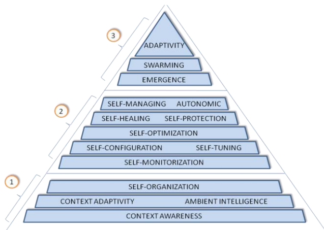
Figure 2. The spectrum of self-properties: a pyramidal representation

capability of a system to perceive its own environment and integrate in it. Pyramid #2 represents behavioral adaptation , i.e. the capability of a system to modify its behavior to adapt to different conditions, ranging from pure observation to full self-management. And pyramid #3 depicts self-adaptation , i.e. the capability of the system to manage its own adaptivity, possibly including its own emergent behavior. Together, this triple representation describes the full range of adaptation .