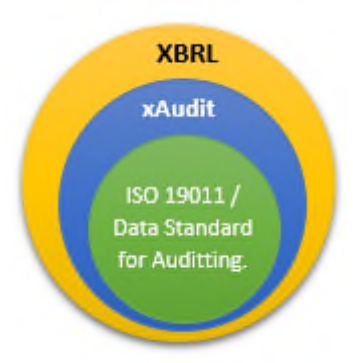
Figure 1. xAudit.

In Figure 1, it is represented the set of documents used as basis for the theoretical foundation of xAudit, as well as its relationship with XBRL technology.