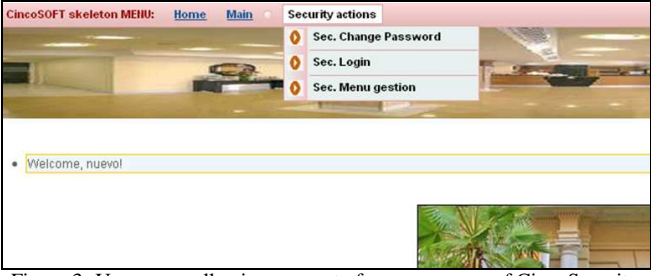
Figure 3: User menu allowing access to fewer use cases of CincoSecurity

The screen snapshot of Figure 2 shows the menu of a user that is enrolled in security profiles allowing access to all the use cases of the CincoSecurity module.