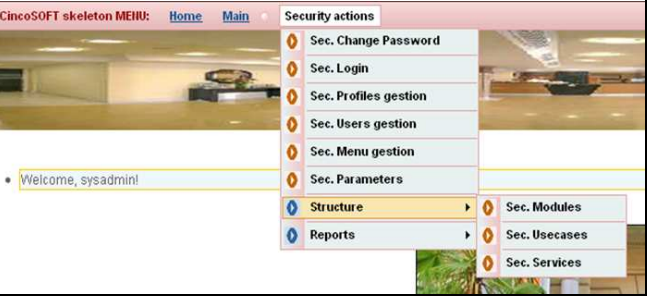
Figure 2: User menu allowing access to all use cases of CincoSecurity

It is important to remark that the access to use cases not authorized to a user by any profile is prevented in two ways. From one side, not authorized use cases do not appear in the user's menu. From the other side —even if the user types in the url of a not authorized use case—the application server throws a security exception because the fine role for entering to this use case was not included in the list of fine roles that was informed to the application server.