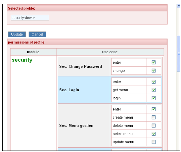
Figure 6: Use case to manage security profiles