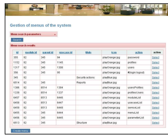
Figure 5: Use case to list/add/edit or remove menu entries.

It can be easily specified which menu entries have a submenu, as well as the use case associated with a terminal entry (see Figure 5).