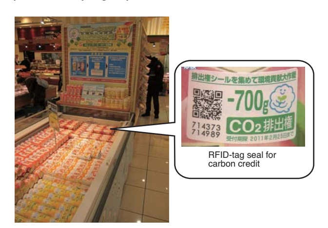
Figure 2. Beverage with RFID tag (or barcodes) seal for carbon credits

forest and were traded on the domestic market and managed by the Forestry Agency.