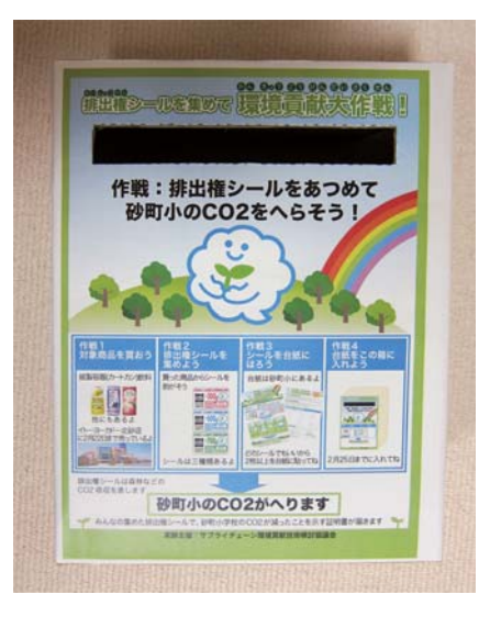
Figure 3. RFID tag/barcode seal collecting box

The supermarket totally sold 5320 cans, where the sales volumes of cans with carbon credits in two weeks was three times more than usual at the supermarket. Thirty-five percent of RFID tags or barcodes were returned to the supermarket by customers who claimed the credits. About 750 tags among them were donated to the school through our approach. There were many lessons learned from the experiment, but most problems in the experiment were not