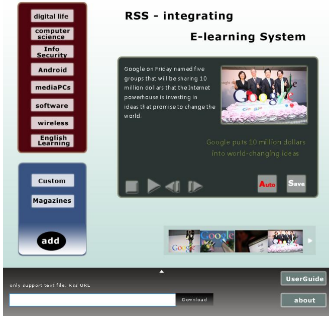
Figure 3. The home page of the ODES system.

read the English topic as well as the content of the article to study language from our learning area.