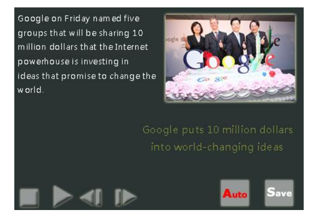
Figure 2. The English learning of the ODES system.