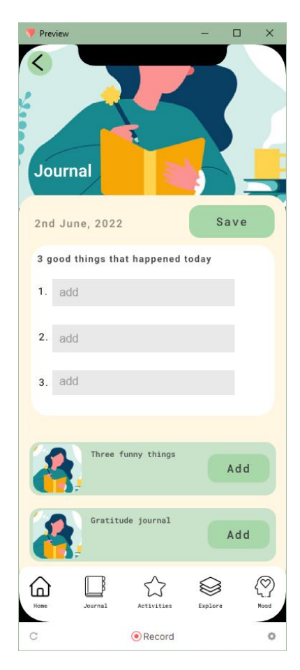
Fig. 1. Journal Exercises

built into a high-fi prototype, such as offering a variety in answers of the chatbot (IA03). Another requirement based on literature was omitted as it contradicted with the interview results: according to previous research, integrating avatars with a similar appearance to users seems to lead to a higher persuasiveness [37]. However, most interviewees stated that they prefer a non-humanlike avatar. This confirms the need to conduct research grounded in case studies [46], [47], and furthermore, at least one additional step of evaluating the prototype should be considered in future work.