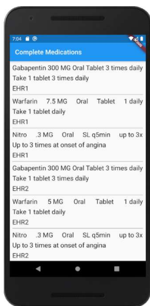
Figure 4. Meds from EHRs.