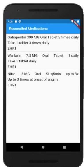
Figure 5. Warfarin reconciled.

patient's medications, with any reconciled drugs also having a DetectedIssue resource in the Bundle naming the matching drugs through the MedicationStatements' FHIR URLs. Although MedicationStatements are parsed and displayed correctly in the medication list screen, parsing the DetectedIssue resources and displaying the DetectedIssues through the interface is still a work in progress.