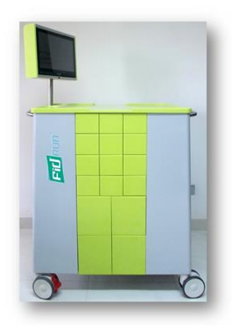
Figure 2. FIDRUN with fours modules. The first two at the top have each six small drawers and two modules at bottom have each two large drawers.

The patient receives a bracelet with his/her own new unique barcode created by FIDCARE in the admission phase and the nurse uses a portable barcode scanner to identify the patient. The nurse may also type the barcode, if he/she does not has a barcode scanner or if it is temporarily unavailable or not working. In addition, operators have a barcode uniquely assigned to themselves, typically included in their badges, and they can use it for login in FIDCARE or FIDRUN, other than using user and password.