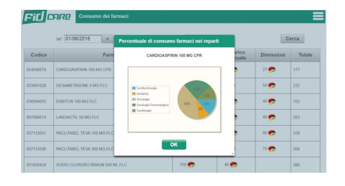
Figure 4. In the background, drugs consuption by period and by usage (therapies, manually unloaded, dismissal therapies). In the foreground, Cardioaspirin 100 mg consuption chart by departments.

Users interact with FIDCARE and FIDRUN through a voice in order to perform some tasks, e.g., initiate a new therapy, confirm an administration an automated, etc. Furthermore, FIDRUN gives acoustic feedbacks for a number of functionalities (e.g., correct execution, alerts, errors, etc.).