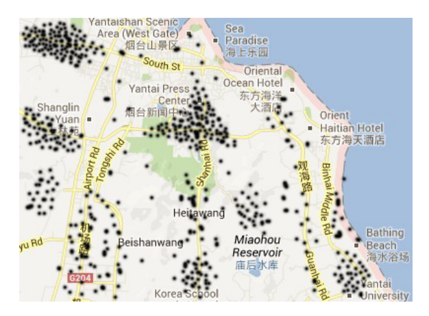
Figure 2. The cluster distribution on workday.

Figures 2 and 3 give an overview of the distribution of studied bus pick-up and drop-off points on workdays and on weekends separately. From the distribution of the clusters in two figures, it can be further observed that the distribution of the attractive areas follow certain pattern while vary crossing workdays and weekends. For example, there are some areas which remain attractive, though the sizes of them vary with time. There are also areas whose LoA are time-dependent. Moreover, we can see that people's activities are more concentrated on work places and living places on workdays, while places of amusement and schools are more attractive on weekends.