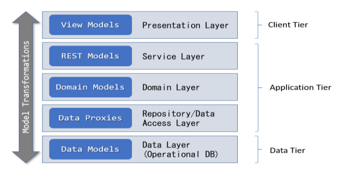
Figure 3. Layered architecture with layer-specific models and model transformations.

Although it is uncommon to replace the database technology altogether, sometimes it may be required to