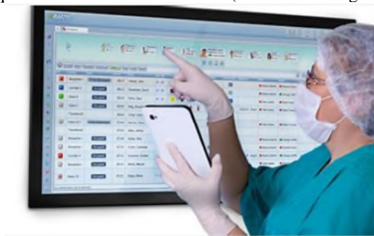
Figure 3. The patient whiteboard

Besides being automatically exported to the EHR, the NEWS scores from the app were exported to the electronic patient whiteboards that all departments at the hospitals had in their ward offices (illustrated in Figure 3).