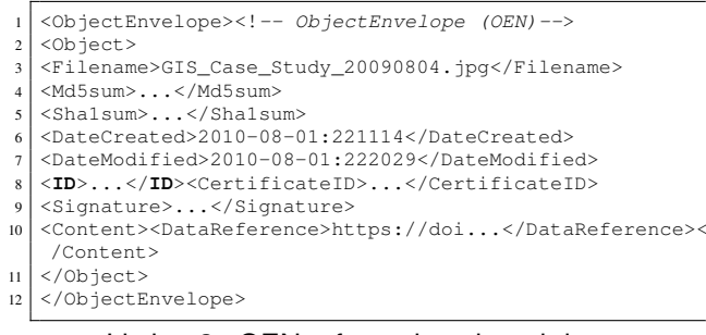
Listing 2. OEN referencing signed data.

An end-user public client application may be implemented via a browser plugin, based on appropriate services. With OEN instructions embedded in envelopes, for example as XML-based element structure representation, content can be handled as content-stream or as content-reference. The way this will have to be implemented for different use cases depends on the situation, and in many cases on the size and number of data objects. Listing 2 shows a small example for an OEN file using a content DataReference.