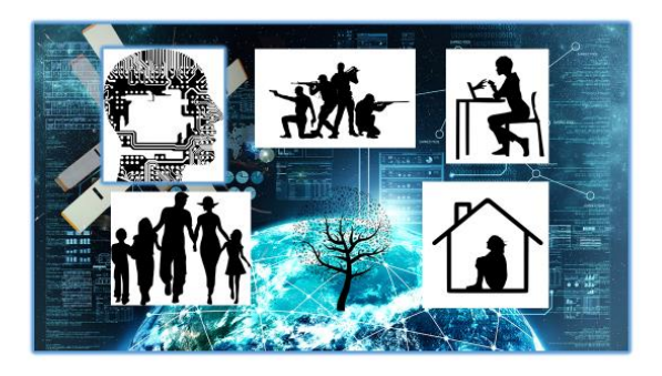
Figure 1. Cyber Meta-reality.