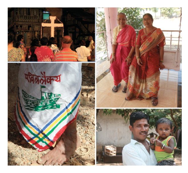
Figure 1. The East Indians of Mumbai, India.

Figure 1 shows a series of photographs from the community depicting worship, costume, family and living.