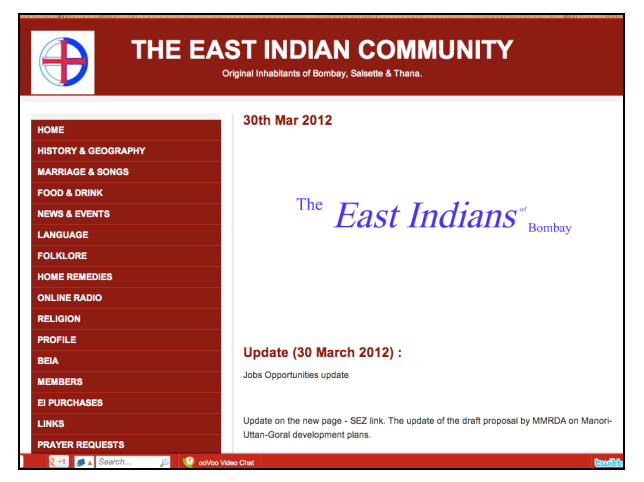
Figure 2. Home page of the East Indian Community website (www.east-indians.com)

fragmentation of the community leading to loss in collective identity.