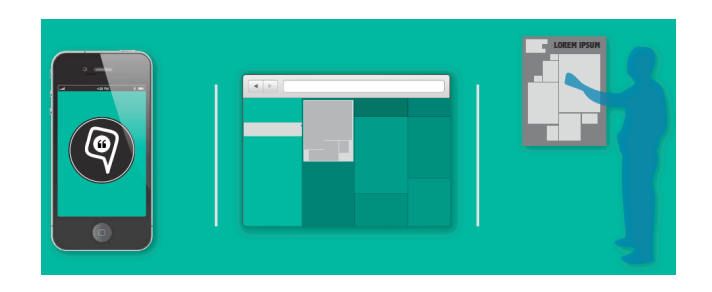
Figure 5. Three components - Mobile, Web and Public Display

The above-mentioned functions take place over an ecosystem comprising of three components described as follows (see Figure 5 ):