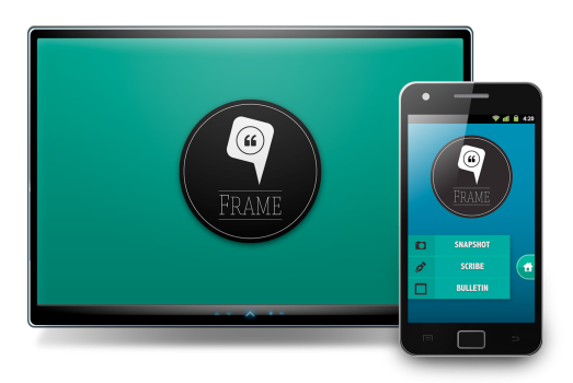
Figure 6. Interface design of the system - Frame

We are currently developing a prototype of the system. As part of user studies and follow on work, we will carry out a series of iterations and refinements to gauge the usability and user interactions of the system in order to evolve the system into a highly intuitive system to serve the multi-local yet traditional community.