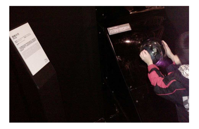
Figure 1. The Mirage in Being digital artwork exhibition

This research focuses on to develop a novel interactive device for collaborative memory creation and navigation. Using the metaphor of crystal ball, participants intuitively enter the magical memory space and control the time axis to reverse the world with bare hands. Through the memory navigation, they sense the strong connections with others who ever had similar experiences at the same place. With the magical power gift, during the touching process they gradually turn the world into their world with self-memories, as in the Genesis the God gives Adam life, and enhance their self-conscious. We also design the affection computation method for analysis the interesting affection amplification effect between the participants.