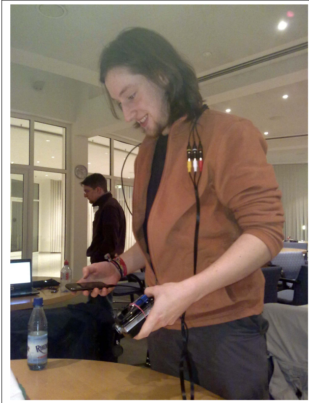
Figure 3. User plays with first prototype

later implementations. In the calibration phase, the images are analyzed for 3 seconds and the average value is stored for usage in the next game.