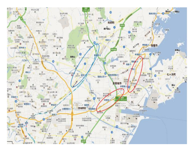
Figure 3. Map of Tagajo (map data provided by Google Maps)

a result, major traffic congestion occurred on the highway due to the increase in cars.