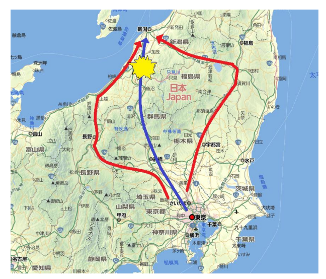
Figure 1. Ensuring alternative routes (map data provided by Yahoo Maps)

This paper proposes a route recommendation system in disaster-struck areas, targeting affected drivers with consideration for this kind of psychology of victims.