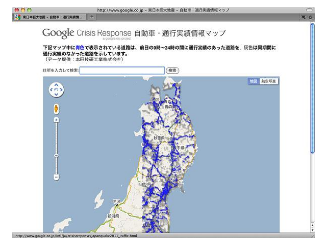
Figure 2. Google's Map of Automobile Traffic Performance

These services, however, are useful in everyday use and special functions are required in disaster situations.