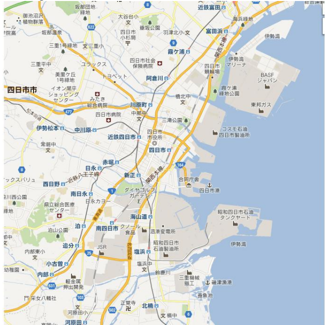
Figure 4. Target area, Yokkaichi. (map data provided by Google Maps)

If there are any roads that the user wants to avoid, the system will propose a route excluding these. For example, the system proposes a route which will not be affected by tsunami according to the hazard map, but the user is worried that this road may be dangerous. In such cases, the user can deselect the route they do not want to use, and search for the route again in consideration of this.