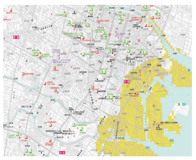
Figure 8. Hazard map of Yokkaichi(map data provided by the Ministry of Land, Infrastructure, Transport and Tourism )

A hazard map is a map that highlights areas that are affected by or vulnerable to a particular hazard. They are typically created for natural hazards such as earthquakes, volcano eruptions, landslides, flooding, and tsunami. Hazard maps help prevent serious damage and deaths, and help victims to take refuge quickly and precisely. Figure 8 shows a hazard map of Yokkaichi [6]. This map data provided by the Ministry of Land, Infrastructure, Transport and Tourism.