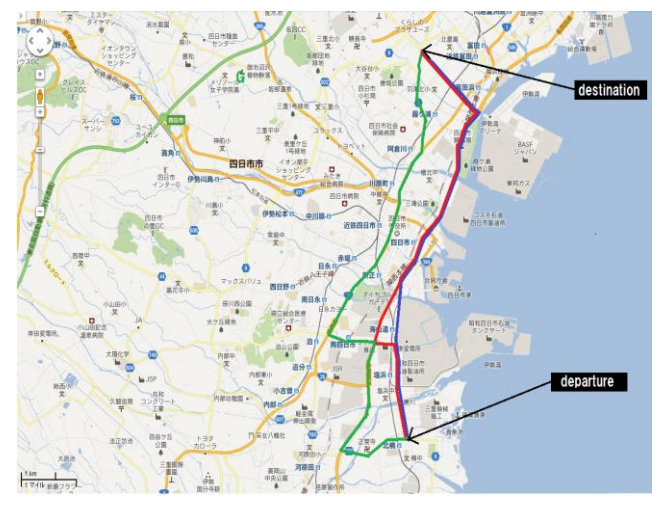
Figure 7. Recommendation results.

The same departure and destination were set in NAVITIME, MapFanWeb, and the proposed system. Figure 7 shows the route recommendation results by these systems. A recommendation result by NAVITIME is indicated in blue, MapFanWeb in red, and the proposed system in green. NAVITIME and MapFanWeb recommended National Route 23, along the sea, while the proposed system selected National Route 1, which is further inland than National Route 23.