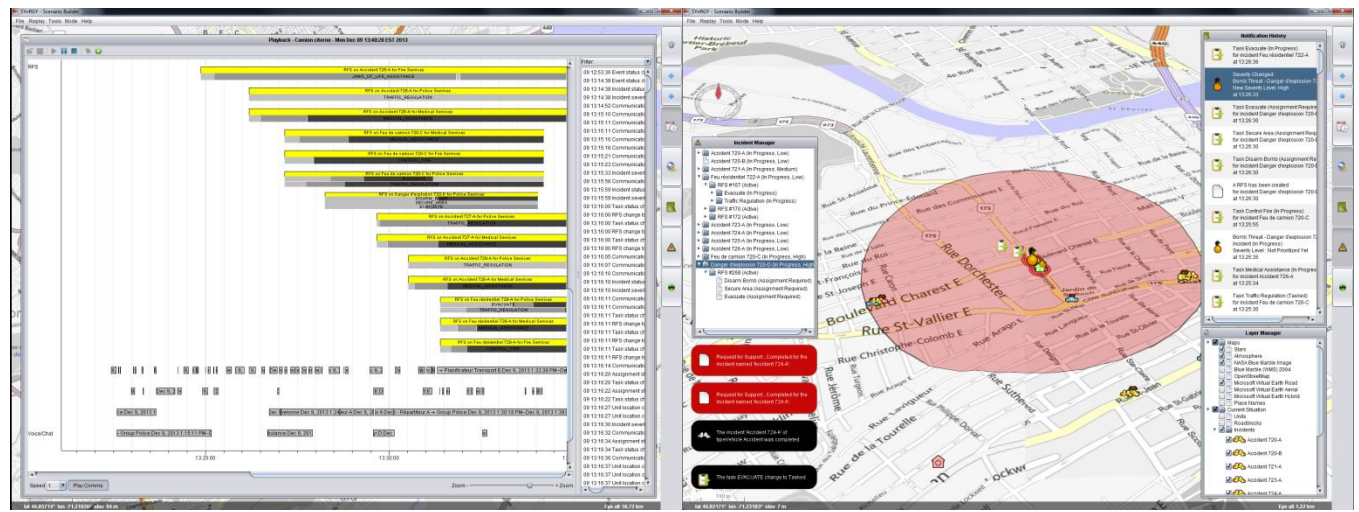
Figure 2. SYnRGY Simulation platform.