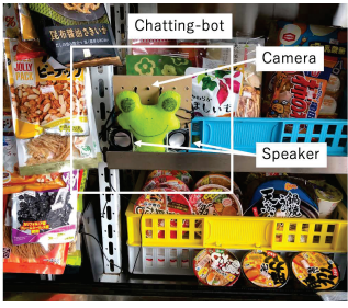
Figure 2. Inside of a moving stall (left). Foods and daily necessities are sold. Developed chatting bot as a stuffed frog (right).

bot gives speeches to prompt new items and invites playing a game. For example, "New goods are coming" and "Please find it" would be given with a synthesized voice.