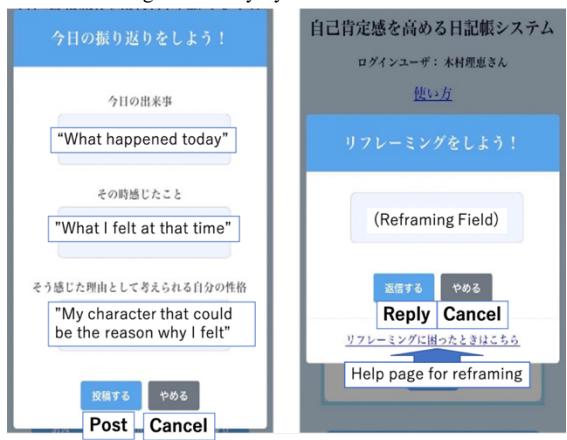
Figure 2: Diary submission page (left) and Reframing page (right).

To post a diary entry, the user clicks the "Post" button on the home screen (Figure 1), and is taken to the diary posting window (Figure 2, left). In this window, three items can be filled in: "What happened today," "What I felt at that time," and "My character that could be the reason why I felt ". If the third item is negative, our system users will reframe the diary when the system is used the next day.