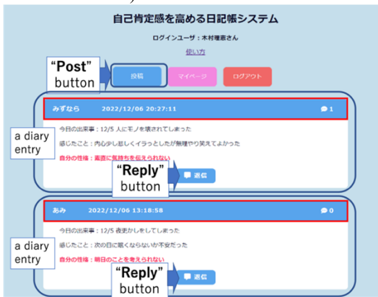
Figure 1: Diary System's Home Screen.

When logging into the system, each user uses his/her own google account. When logging in for the first time, they were redirected to the new registration screen, where they registered their nickname and reframing method ("your own" or "someone else's").