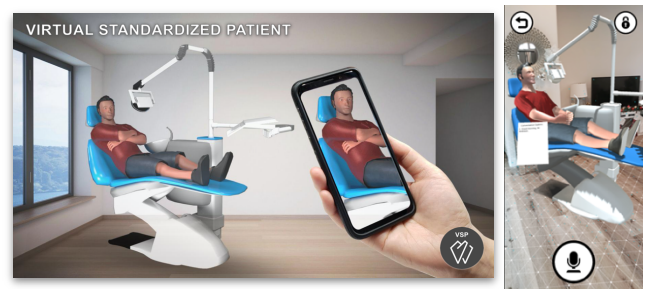
Figure 3. VSP's Markerless AR session.

VSP project is an immersive learning platform that employed both AR and VR technology. AR is a technology that allow user to see the real worlds, with virtual objects superimposed upon or composited with the real world [4]. Furthermore, AR is a system that have the following three characteristics: combines real and virtual, interactive in real time and registered in 3D [6]. For VSP's AR session, we applied a markerless experience powered by Google ARCore Software Development Kit (SDK). With ARCore, user could scan their room, place the virtual patient on the designated spot, and the virtual patient will be immersed onto user's real space without any printed marker as shown in Figure 3.