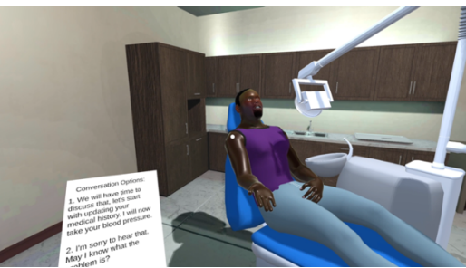
Figure 4. VSP's VR session.

VR is defined as a computer-generated digital environment that can be experienced with as if that environment was real [3]. In VSP project, user has an option to switch from AR to VR mode. In this session, they will be fully immersed into the dentist room and interact with the virtual patient there as shown in Figure 4.