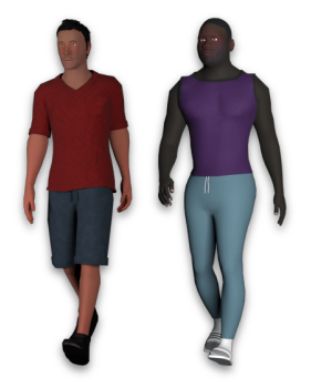
Figure 2. VSP's Virtual Patients

In this project, we included two virtual patients that represent different races and communities, as shown in Figure 2. The virtual patients wear casual dress code and they are rigged and animated following the prepared dialogue.