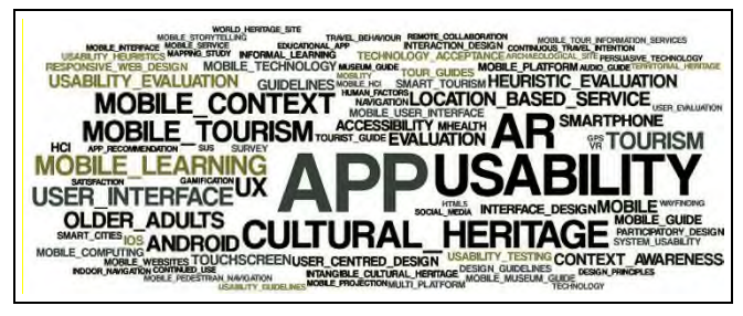
Figure 3. Word cloud generated from the used keywords from the reading selection.

The selected readings, apart from those dealing with app interface and usability, dealt with topics such as cultural heritage, mobile tourism, mobile health, mobile learning, older adults, just to mention a few examples. Based on the readings' keywords (when available), a word cloud was generated to illustrate the full range of selected topics (Figure 3).