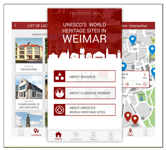
Figure 4. Prototype Red, with less content on the main menu, bigger tiles for pages and standard map icons.

implemented to avoid conflict for possible colour-blind testers.