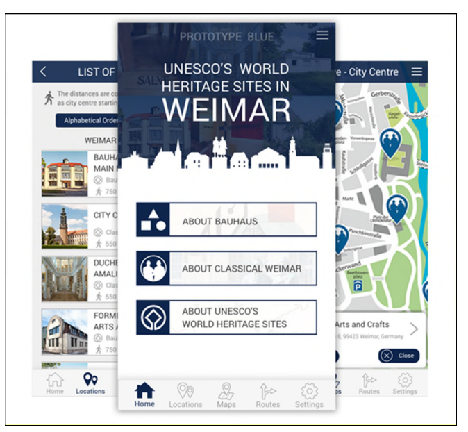
Figure 5. Prototype Blue, with more items on the main menu, detailed tiles for pages and customised icons for the map.