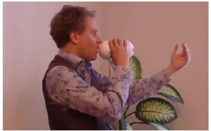
Figure 3: Playing the Trombosonic, the red laser in the palm indicates the direction of the ultrasonic sensor

The casing of the interface is cylindrical with rounded ends and made of polystyrene and wood (see Fig. 1 and Fig. 4). This keeps it lightweight but stable and handy. All electronic