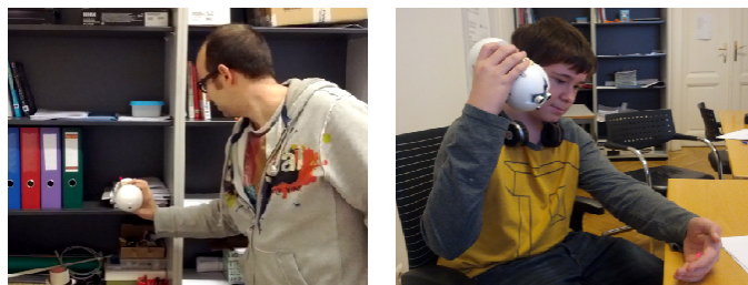
Figure 6: People playing the Trombosonic, as a one-handed instrument acoustically exploring a shelf (left), trying its features played with two hands (right)

The trial with the interaction designer suggests some usability improvements for a more intuitive handling. Furthermore, it might be worth considering the Trombosonic as a one-handed musical instrument keeping in mind that “thousands of people with disabilities in the UK, and millions across the world, are excluded from music making” [22]. The Trombosonic could be such an instrument to enable those