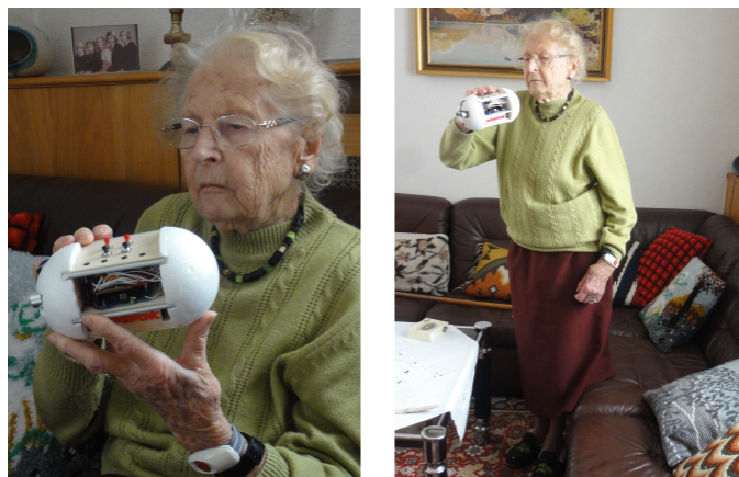
Figure 5: A 92-year-old woman playing the Trombosonic: First impression (left), standing to operate it “in another way” (right)

We then gave the Trombosonic to a 92-year-old woman who is a relative of one of our project members. She was willing to help us for the evaluation during a visit at her own house. She has full mental abilities apart from some forgetfulness from time to time, as she confessed herself. She