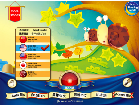
Figure 1. The Little Snail