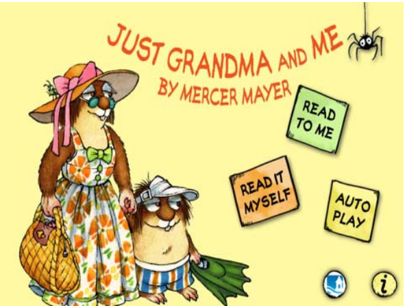
Figure 3. Just Grandma and Me