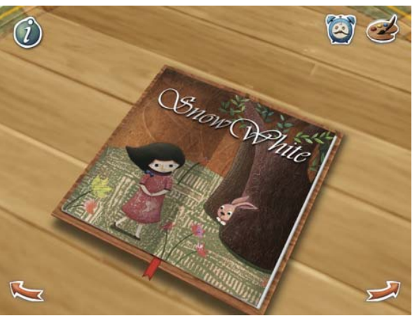
Figure 6. Snow White - 3D Pop-up Book