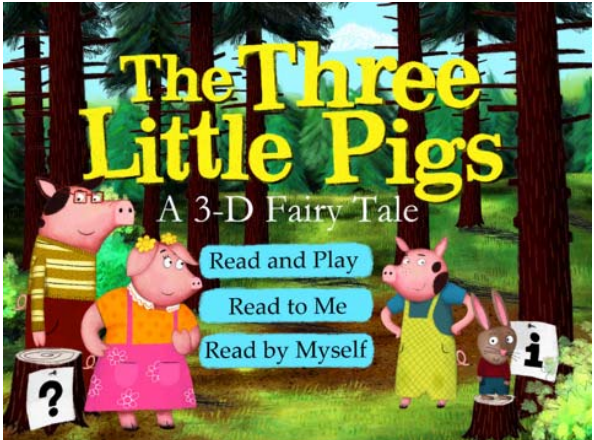
Figure 5. The Little Snail