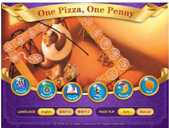
Figure 2. One Pizza, One Penny