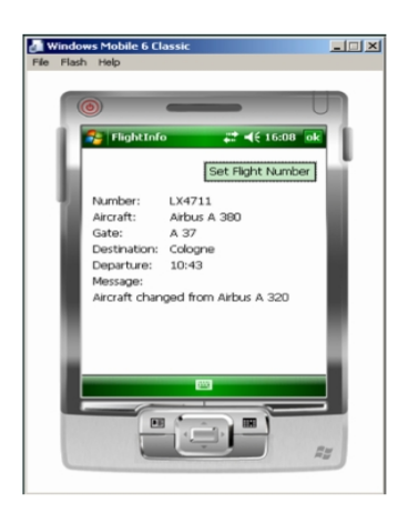
Figure 21. GUI of mobile client.

In addition, the mobile client lets passengers receive updated flight information from the comfort of their mobile phones. Figure 21 shows GUI of the mobile client.