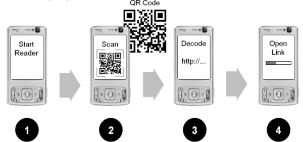
Figure 1. Mobile Tagging processing flow

Mobile Tagging refers to the process of barcode decoding with camera-equipped mobile devices. At this, one scans a two-dimensional (2D) barcode -the so called Mobile Tag- with a camera phone, to decode and process information embedded in the Tag. These 2D barcodes do have enhanced capabilities compared to traditional onedimensional (1D) barcodes known from common consumption goods, providing a much higher data capacity. Thus, they can store more as well as also alphanumeric information with an improved robustness. Meanwhile, more than thirty different 2D barcode types have been developed since the late 1980s [21], and some of them are suitable for being captured and processed by mobile devices or even were developed specifically for this purpose. Examples of such Mobile Tags are DataMatrix, Aztec Code, ShotCode, BeeTagg and the well-known Quick Response (QR) Code, which is also employed in this study. Although all of those Mobile Tags differ slightly in standards in terms of their technical characteristics and common application areas, they are characterized by a similar functional principle and typical processing flow as shown in Fig. 1: (1) activation of barcode reader software on the mobile device, (2) capturing barcode by embedded camera, (3) automatically detecting code area and decoding data by reader software, (4) displaying decoded information and providing further options for utilization [32]. QR Code