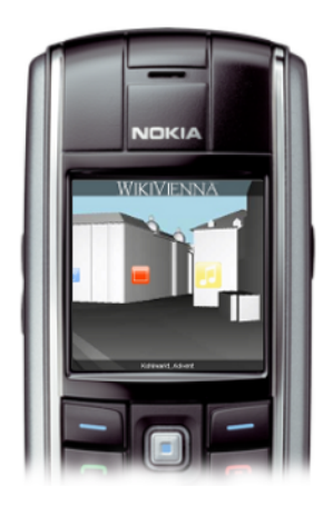
Fig. 3. Device-adapted panorama augmented with selectable POIs.