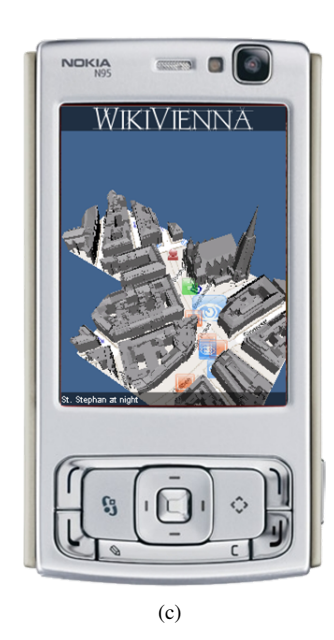
Fig. 4. Tile-based real-time rendering on a smartphone.

technique is applied. Thus, the user is provided with a detailed 3D model where the viewing point can be changed in real-time. By default, the camera shows the user's position (or any other desired city location) in bird's eye perspective elevated by 45 degrees (Figure 4).