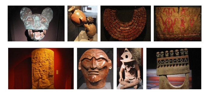
Figure 6. Sample COLLECTION - Precolombian Museum.

The objects are linked by relations in the n-dimensional object space. The slices with a selected number of dimensions carry the common information, e.g., "Stone Age flint arrow heads" in a specific area. It is essential not to sort objects into layers within a database-like structure. So vectors and relations can help to represent their nature in a more natural way. The views, even traditional layered ones, are created from these by appropriate components. The following figures illustrate structure and references for collections, context, and integration of multi-disciplinary information: museum topical collection (Figure 6), context of amphores (Figure 7), and geology information (Figure 8).