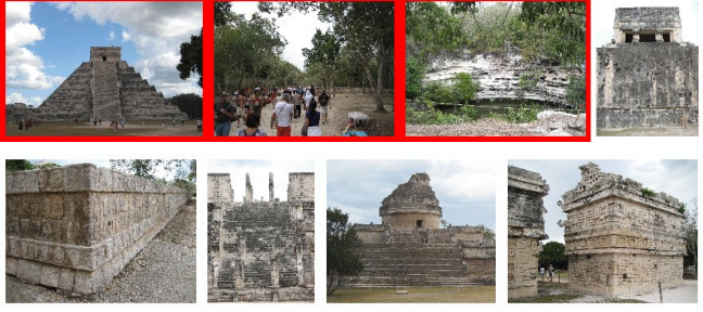
Figure 5. In-topic CONNECT - Kukulkán, Cenote, connected by Sacbé.