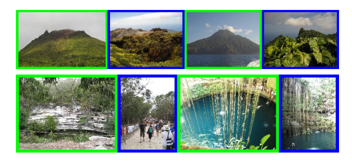
Figure 4. In-purpose: VIEW-TO VIEW-FROM - Volcanoes and Cenotes.

Besides that, viewing directions can be referred, e.g., "view to", "view from", "detail" as shown with a VIEW example (Figure 4) for the above selection with UDC "(23)", "(24)".