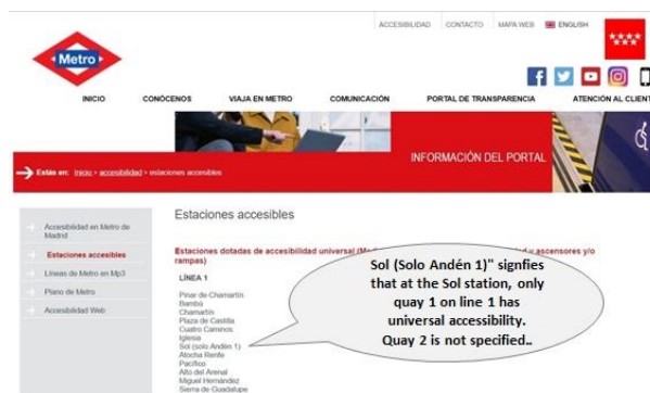
Figure 2 Quay 2 on line 1 is not accessible for wheelchairs at the Sol stop place.

The following piece of the code describes the accessibility for Metro Madrid, focusing on the Sol stop place and the two quays on lines number 1 and 2 (see Figure 3).