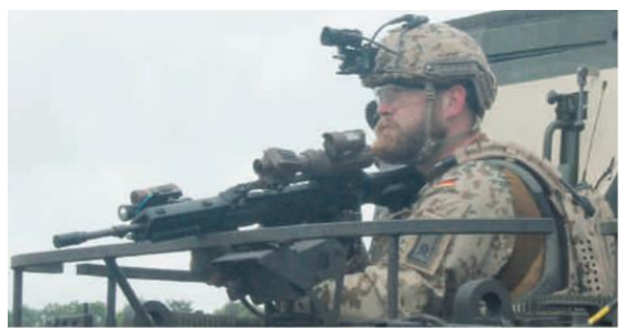
Figure 1. FAST helmet with the concept "Infantry of the Future" [6].

improvements at the retention system with a multi-pad and four-point retention system. In addition to the reduced weight, the FAST helmet provides higher comfort.