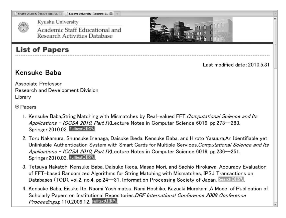
Figure 4. The viewer system of DHJS connected with QIR. This example is the list of the papers of "Kensuke Baba" in DHJS.

an effectiveness of the developed system by analyzing the number of the registrations and the ratio of the registrations by the system. Additionally, we are planning to develop an "embargo" system in the IR, that is, a system to manage the exhibition of the papers on the basis of the copyrights and the policies of publishers. The embargo system can make more efficient the operations for registrations to IRs.