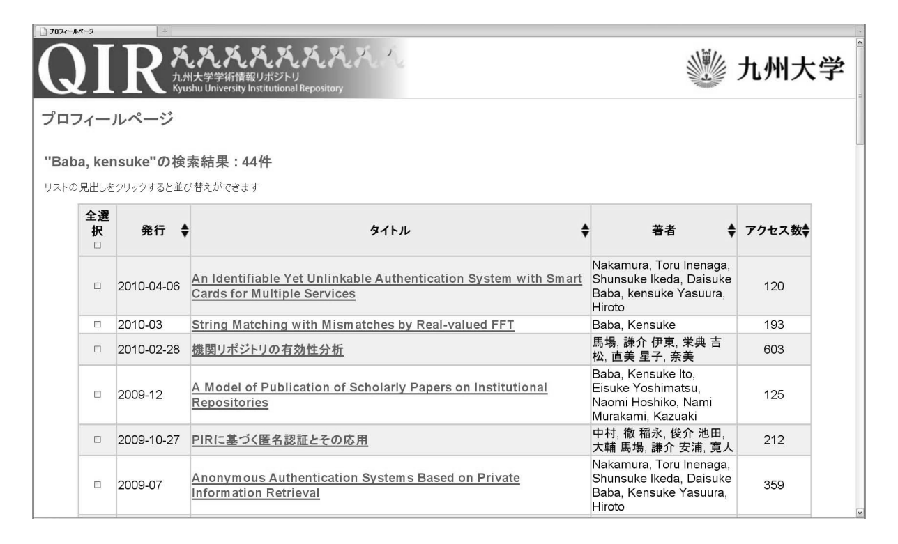
Figure 1. The web image of a list of papers stored in QIR. This example is the result of a search of "Kensuke Baba" in the author fields.

to QIR. Therefore, there is yet room for improvement of the number of the contents in QIR.