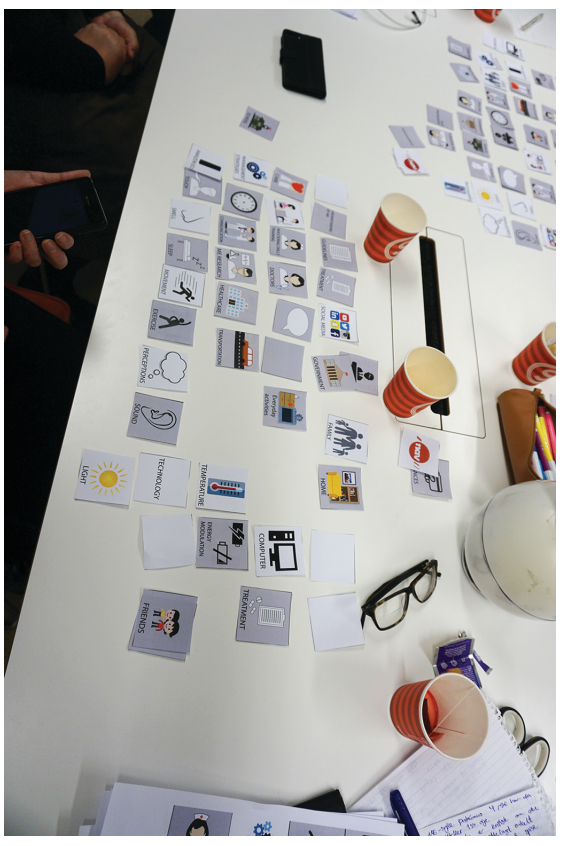
Figure 4. The robot from our first technology design case.

next iteration of the Giga-map, we actively used these two findings.