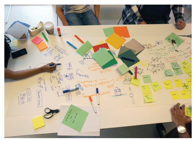
Figure 3. The Giga-map workshop.

suffering from ME/CFS. Using design as a powerful tool to make concerns about co-habitation and democracy visible. Fostering participation from relevant communities could prove to be the best way to address the wickedness of the problem. Thirdly, we want to use the initially developed map together with new Giga-maps and thick descriptions from the ANT analysis and our qualitative research, as a way of documenting design processes and technology developments addressing wicked problems.