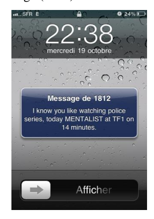
Figure 11. Sending SMS through phone channel to reach disconnected user

As we said in previous sections, we tried to provide proactive intelligent interfaces which can associate different types of modalities with different channels. However, when the user is disconnected from the internet network channel, and if the agent has important information to communicate to her, it should find a new way of communication to reach her wherever she is (home, office, outside, etc.). So, as second channel of communication that can be interesting in our work, we have chosen the phone channel, which allows our system to communicate with people when they are disconnected from the internet. This step is very important in our research; it ensures the continuity with the user by sending for example a Short Message Service message (SMS) as illustrated with Figure 11.