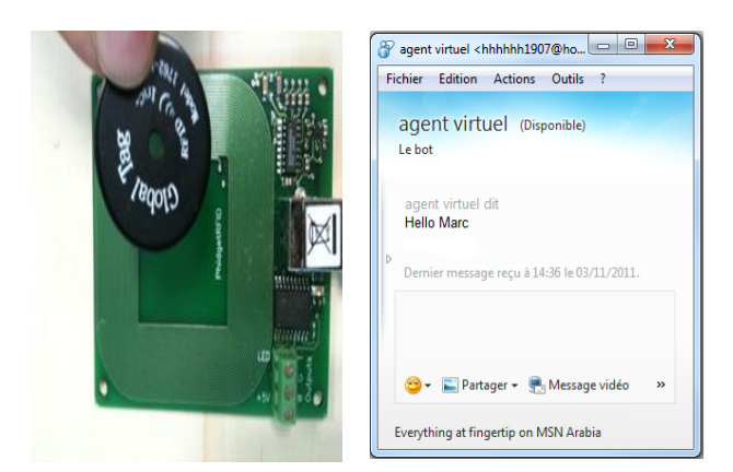
Figure 4. Marc's RFID tag.