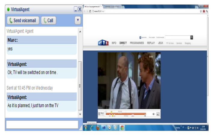
Figure 10. Agent notifies user that the TV is switched on

If the user responds "YES" using either a keyboard (see Figure 8), a voice recognition or a gesture through a Kinect sensor (see Figure 9), the agent turns on TV in the appropriate time. In that scenario, by executing this action, the system sends, after six minutes, a new text message to the user, telling that the TV is switched on TF1 channel (see Figure 10), but it can also in other situations (e.g., user at home) communicate the same service using a more natural modality such as the vocal one (speech synthesis).