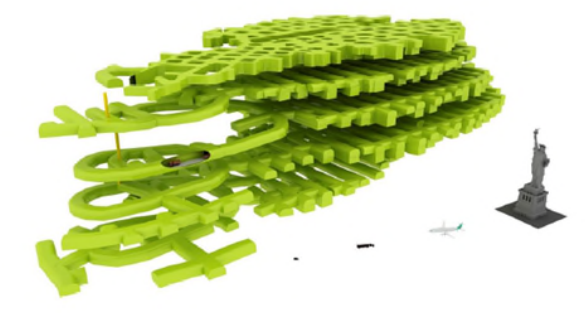
Figure 1. Lefdal Mine Datacenter [7]

cooled from the local fjord, and a five-level installation in an old mineral mine near Måløy (550 kilometers north-east of Oslo) in Norway. Fig. 1 shows the picture and the dimensions of LMD in comparison to the New York Statue of Liberty, a commercial airplane, a truck and a car vehicle.