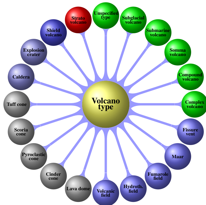
Figure 2. Object carousel for volcano and type references computed for terrestrial volcanism, providing volcano type references.

Suitable views for volcanoes are: Type (of volcano, coarse categories), date on timeline, size (height). For craters respective views are: Type (of crater, fragmentary), date on timeline, size (diameter). An object carousel generated for volcano types, shows the knowledge resources groups (Figure 2).