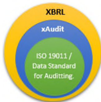
Figure 1. xAudit.

In Figure 1, it is represented the set of documents used as basis for the theoretical foundation of xAudit, as well as its relationship with XBRL technology.