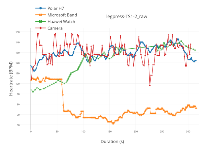
Figure 2. Heart rate measured during leg press.

Figure 1, 2, 3, and 4 show the heart rate measurements obtained with the four devices for four different exercises, respectively Stair Master, Leg Press, Dumbbell Curl, and Long Walking. All exercises are performed in a fitness room by two persons with similar results. The results of one person