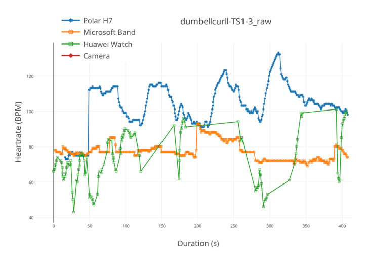
Figure 3. Heart rate measured during dumbbell curl.

Figure 1, 2, 3, and 4 show the heart rate measurements obtained with the four devices for four different exercises, respectively Stair Master, Leg Press, Dumbbell Curl, and Long Walking. All exercises are performed in a fitness room by two persons with similar results. The results of one person