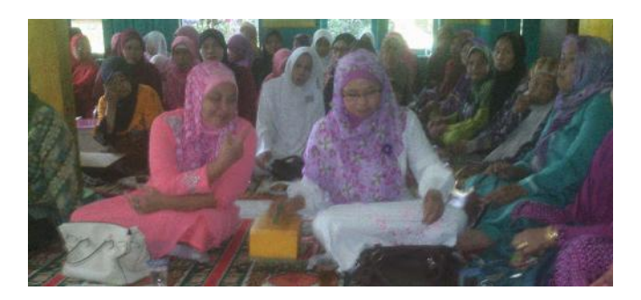
Figure 1. Training of women to detect and understand the symptoms of TB diseases

Each training took 3 days per season within two months. We held four trainings for the Lebak women. We also suggested the women who have received training to teach about TB symptoms to their social groups, such as their Quran recitar ( pengajian ) group and local women empowerment (PKK) (Fig. 1).