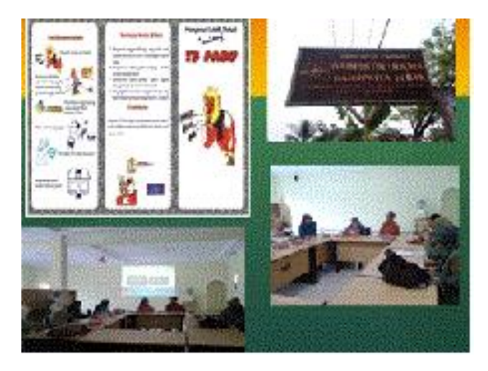
Figure 2. Finished leaflet and process of designing leaflets

A communication media by creating leaflet and pocket book had been designed. This aims to provide information of TB, its signs and symptoms, and preventive measures. In this leaflet, there was also information of a Short Message System (SMS) gateway number that can be reached by the target group if TB symptoms are found in the family or surrounding community. On the other hand, the pocket book provides information on how to use the SMS application information system for health officers in PHC and mothers. Figure 2 illustrates the design process of leaflets, booklets about TB symptoms should be known and understood by mothers through several meetings.