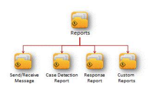
Figure 3. Schematic of the SMS system report

empowering community, especially women, to be able to perform active surveillance was a key element in the implementation of the information system. In order to reduce the difficulties experienced by that target user in using information system, in the early stages of implementation, health officers and community organizations will provide continuous assistance (Fig. 3) [14]. SMS or text messages are used to register suspect TB patients which are sent by trained women. If problems persist, health officers are to provide manual records to grant data transmission. These two activities will be conducted by considering the community's ability to adapt to the information system (technology acceptance).