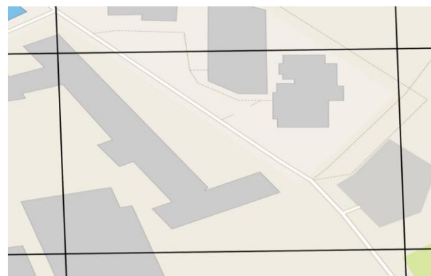
Figure 5. Lack of mapping due to anonymization of census data, © OpenStreetMap contributors

buildings with elderly residences and a school building (left part of Figure 5). So far, the method described here cannot account for these 76 residents without information on buildings and households.