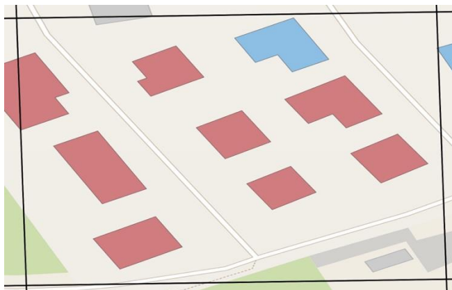
Figure 4. Classification result by building type (size).

In total, 25 residents are distributed across twelve households in this grid cell. More specifically, three households consist of couples with one child, two households with a single parent and one child, two single-person households, and five couples with no children. For each resident, the characteristics listed in Table 1 are available. The grid cell shown is characterized by its relatively homogeneous settlement structure. This is a factor of a high level of coherence between Census and OpenStreetMap data. However, this needs further investigation.