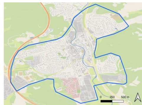
Figure 3. Overview across the test area of the city of Herborn, © OpenStreetMap contributors.

The method presented here was applied to the city of Herborn as a test area (Germany, state of Hesse) shown in Figure 3. The area covers an area of approximately 4.52 km 2 with 257 residential grid cells. 1,992 houses were derived and enriched with attributes relevant for demographic analyses.