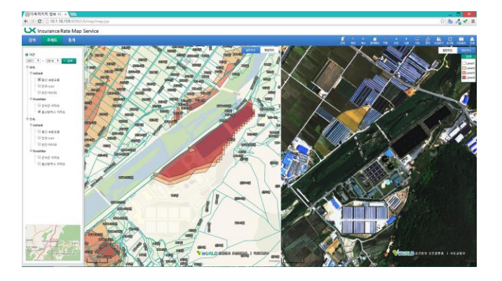
Figure 3. Geolink

The main interface of the prototype system is presented in Figure 2. This system can operate the general functions of map systems such as zoom, move, measurement tools, property view, and print. The system can also overlay a natural disaster map on a cadastral map for a nested view. In this case, the location of the nesting area is difficult to confirm, so Geo-link is implemented using Openlayers [9], as shown in Figure 3. Geo-link is a technology for splitting a browser window into two, with the locations of each halfwindow related to each other. Each layer of the respective domain can be individually controlled.