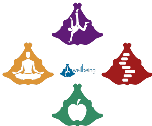
Figure 1. Wellbeing platform and modules